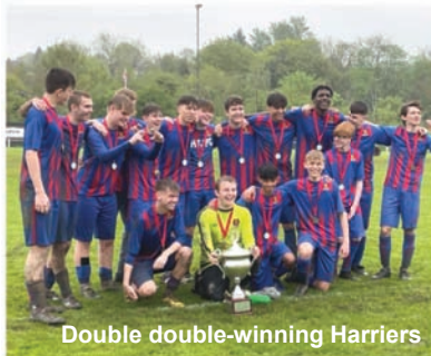
Double double-winning Harriers

It's been another great season for HTJFC - seventeen teams playing competitively at the club (including an unprecedented three teams at U8 level!), and cup or league success for more of our teams than any of us can remember in recent years. However, it's not all about winning silverware - it's great when we can see real team and player development over a period of time, and we hope that all our players can pick up really useful life skills in their time with us.