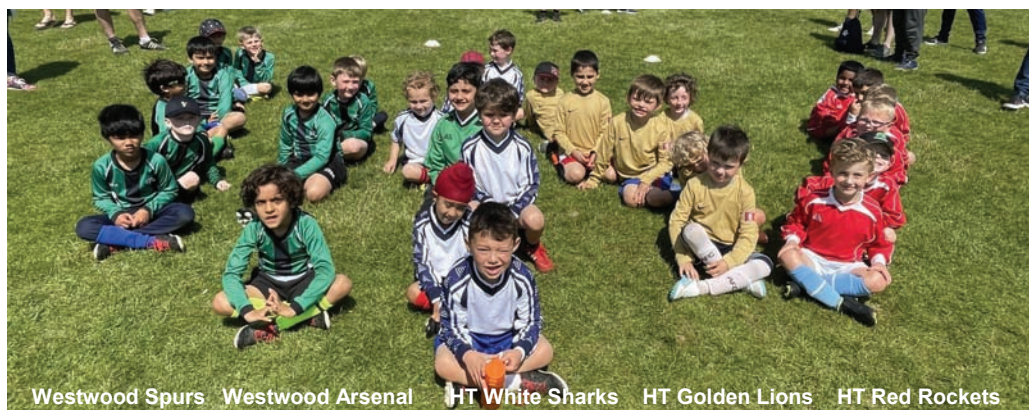
Westwood Spurs Westwood Arsenal HT White Sharks HT Golden Lions HT Red Rockets